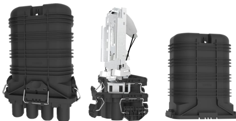
Rectangular Splice Closure Size B - Empty