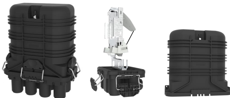
Rectangular Splice Closure Size A- Empty