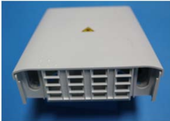
Symetric PBPO NG with external anchoring