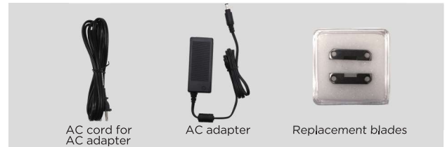
AC cord for AC adapter