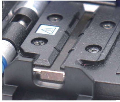
Flat stage for easy cleaning