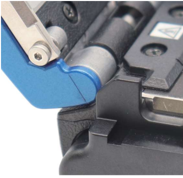
Durable metal hinge