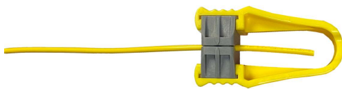
3.0 mm Simplex jacket