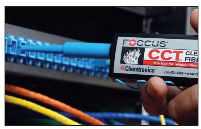
Remove cap for cleaning adapters and bulkheads