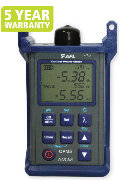
OPM5 Optical Power Meter